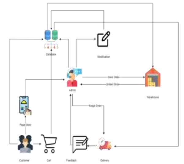
Fig 2: System Architecture